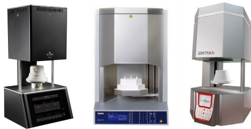
AUSTRUMAT 674i (DEKEMA Dental-Keramiköfen GmbH) inFire HTC speed (Dentsply Sirona) Sintra Plus (Shenpaz Dental Ltd.)